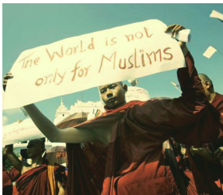
Myanmar Buddhist monks demonstrate against the Organisation of the Islamic Conference in Yangon in 2012.