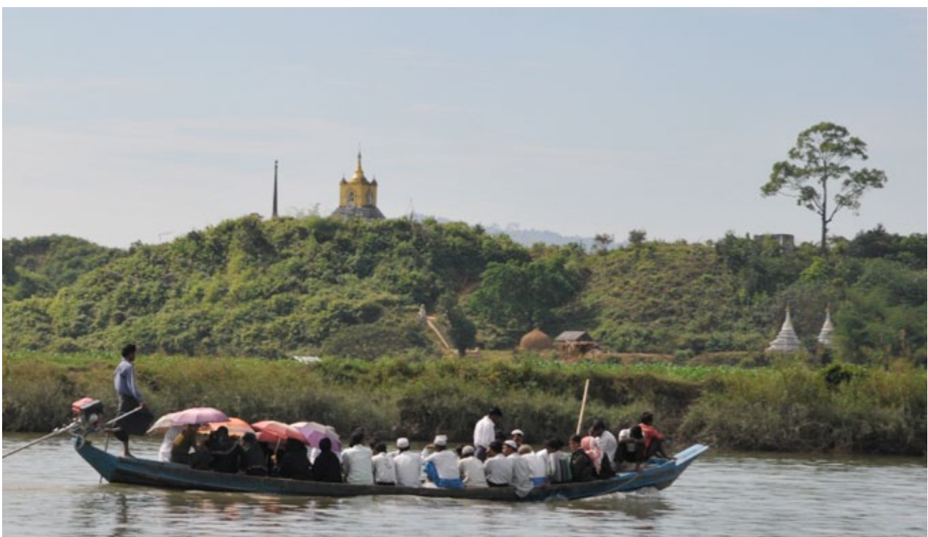
Muslims passing a Buddhist pagoda on the Buthidaung River

All these developments had resonance in north Arakan. Here the political situation was much more critical on the ground. Inter-communal relations remained tense from the Second World War, and confusion reigned as conflict swept through the borderlands after the British departure. Muslim representatives had many reasons for concern. As fighting continued, various accusations began to circulate. These included the allegation that