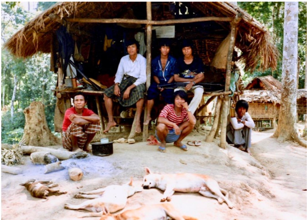
National United Front of Arakan camp (MS)

Inside Myanmar, however, the pace of reform was glacially slow. In 1997, the SLORC was renamed the State Peace and Development Council, but this did not herald any change in government style. Rather, a reform path of labyrinthine complexity was instituted that is still evident today. Once again, this created many dilemmas over policy direction for opposition parties within the country. As in previous governmental eras, it was difficult for ethnic and political movements to find common ground while national politics were so deeply divided. This time, the main schism was between the military government and the NLD that had won the 1990 general election. Political parties –