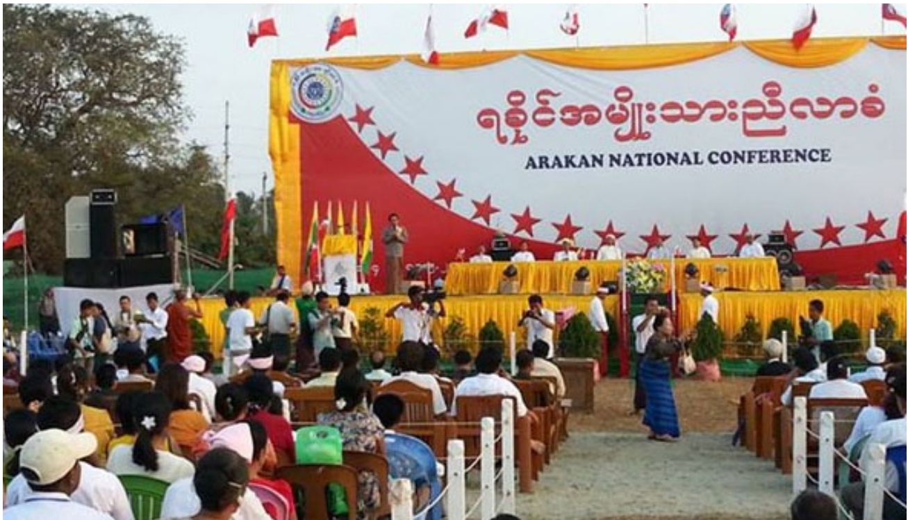
Arakan National Conference, Kyaukpadaung, 2014 (IR)

this occasion, the ALP did sign. But of the eight EAO signatories, only two could be considered of national importance: the KNU and SSA/RCSS. The others were, like the ALP, mostly small or splinter factions from other groups. 84