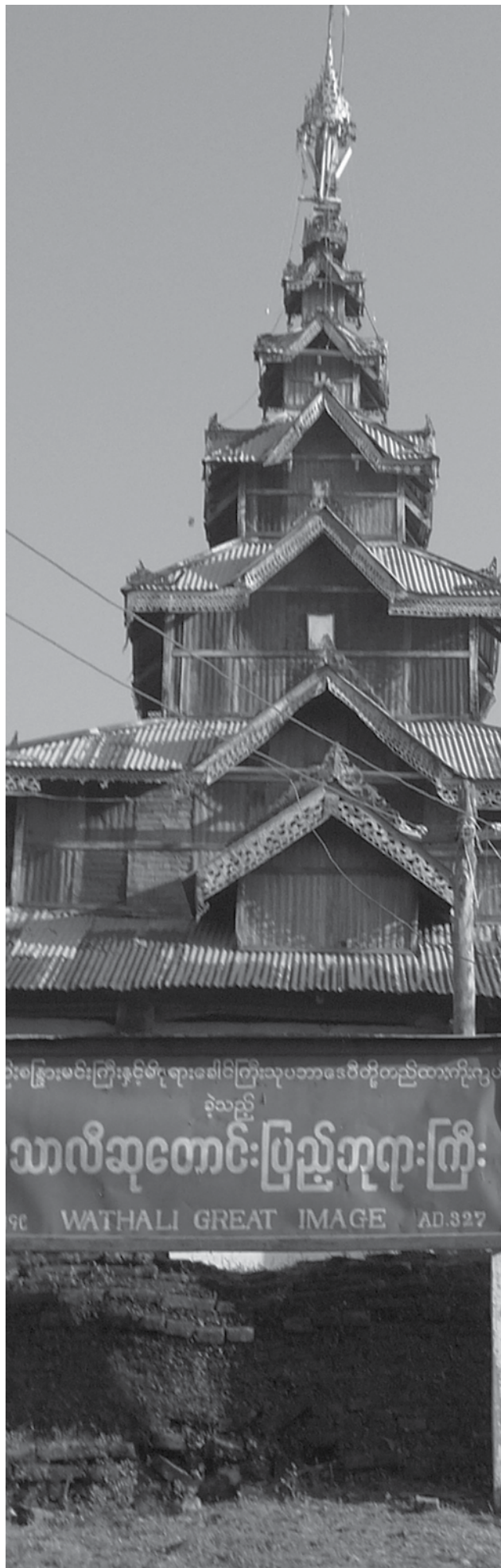
Site of the ancient Great Buddha image, Vesali

Today the ethno-political conflicts in the Rakhine State and the tri-border region with India and Bangladesh are among the most contentious in the country. Disagreements continue over interpretations of history. The struggles for Rakhine State's present are also struggles for Arakan's past. Dating back to the early centuries CE, nearly 2,000 years of civilisation and city-states have been documented within the territory. This is one of the most extensive records of continuous habitation in the sub-Asian region. As various dynasties rose and fell, "Greater Arakan"