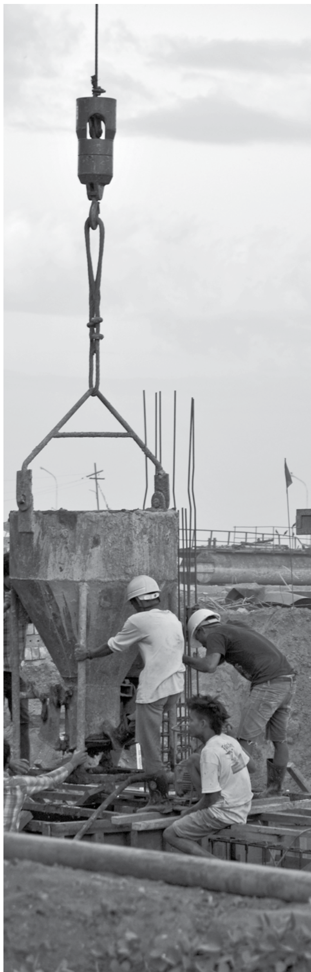
The Kaladan Project, working on expansion of Sittwe port (TK)

Equally critical, despite Thein Sein's promises of peace, there were a number of nationality areas where ceasefire agreements broke down or new conflicts began. Once again, a change in the government system was followed by crisis and volatility in the ethnic borderlands. Initially, most of the fighting centred on the Kachin and northern Shan States where the Tatmadaw resumed military