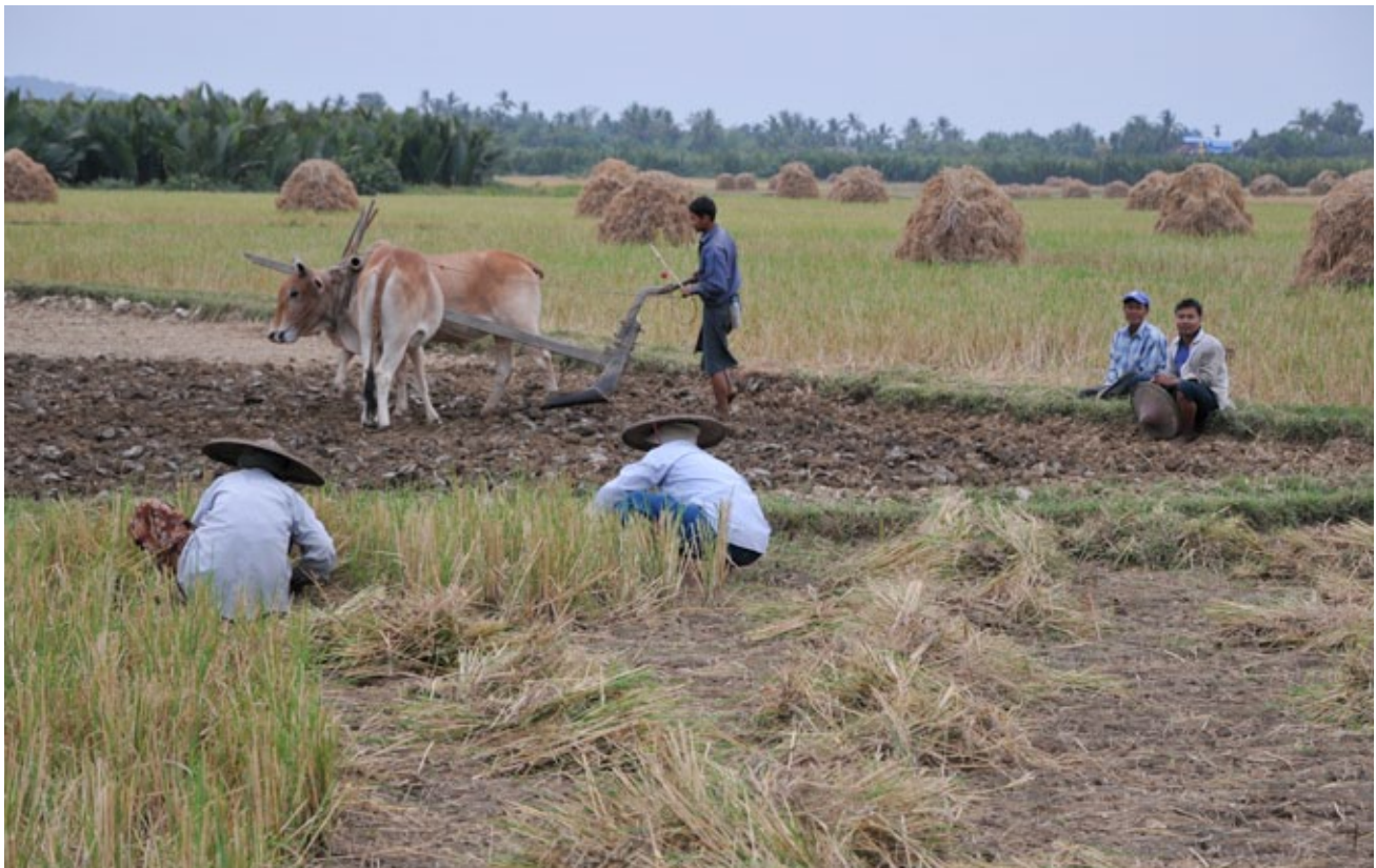
Farmers harvesting rice, Sittwe District

For the Rohingya movement, in contrast, the MFA announcement and Mujahid ceasefire could be seen to mark a breakthrough in post-independence politics. However there were few illusions among Rohingya leaders. As they recognised, the MFA was under Tatmadaw control and did not grant real autonomy. But, for the first time, acceptance of Rohingya identity was gathering pace in the country, and the behaviour of the security forces generally improved towards Muslim communities. There were Rohingya language radio programmes; Rohingya cultural and youth organisations continued to spread; 40 and the MFA marked a time of improved freedoms and job opportunities for Muslims in the north of the territory.