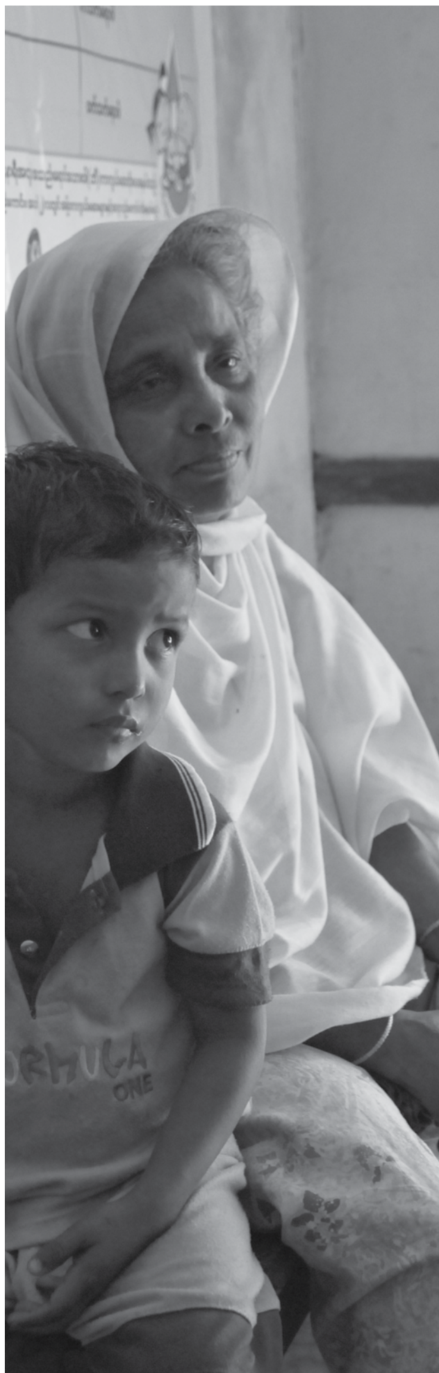
Mother and daughter at Rural Health Centre, Maungdaw District (TK)

Nowhere have these challenges been more deeply felt than in Rakhine State. During another time of national change, the instabilities of central government had a detrimental impact on local communities. The failures of state triggered a new cycle of marginalisation and loss, reaffirming the fundamental question as to how the peoples of Arakan should represent themselves. Should this be through cooperation with the Tatmadaw and parties at the national centre or through the development of political movements in their own land? In the 21 st century, this question remains to be answered.