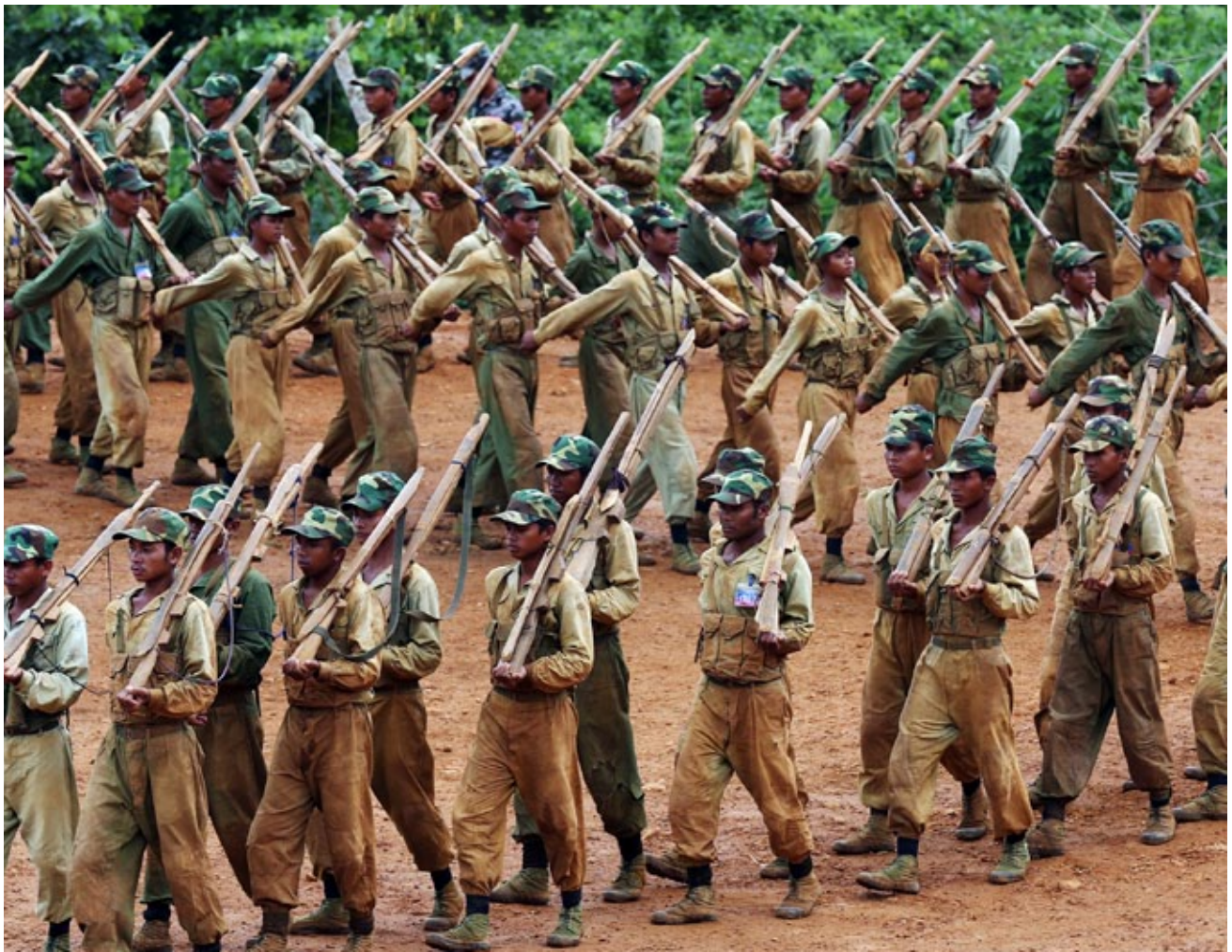
Arakan Army recruits at training camp in Kachin State