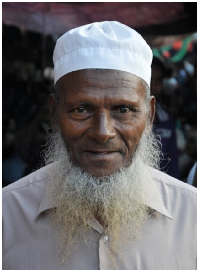
Muslim man at market in Buthidaung town (TK)

In contrast, the situation was deteriorating fast on the other side of the Naf River frontier in the countdown to the British departure. To try and