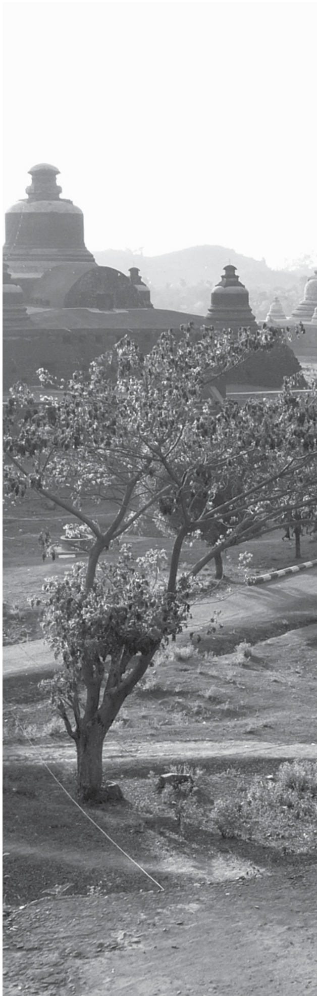
Htulkanthein temple, Mrauk-U (MS)

Since 2011, hopes for reconciliation and national change have been invested in parliamentary reform