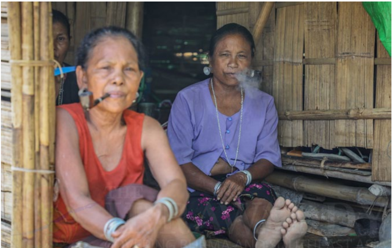
Ethnic Mro women in Ponnagyun Township (IR)

the end of the Cold War, communist ideologies were dropped. The new focus was on federalism, human rights and democracy. The CPB's remaining "Arakan Province" members eventually resettled at a "peace village" near Maungdaw after a 1997 ceasefire with the military government. After four decades of armed struggle, CPB advocacy in Rakhine State was at an end.