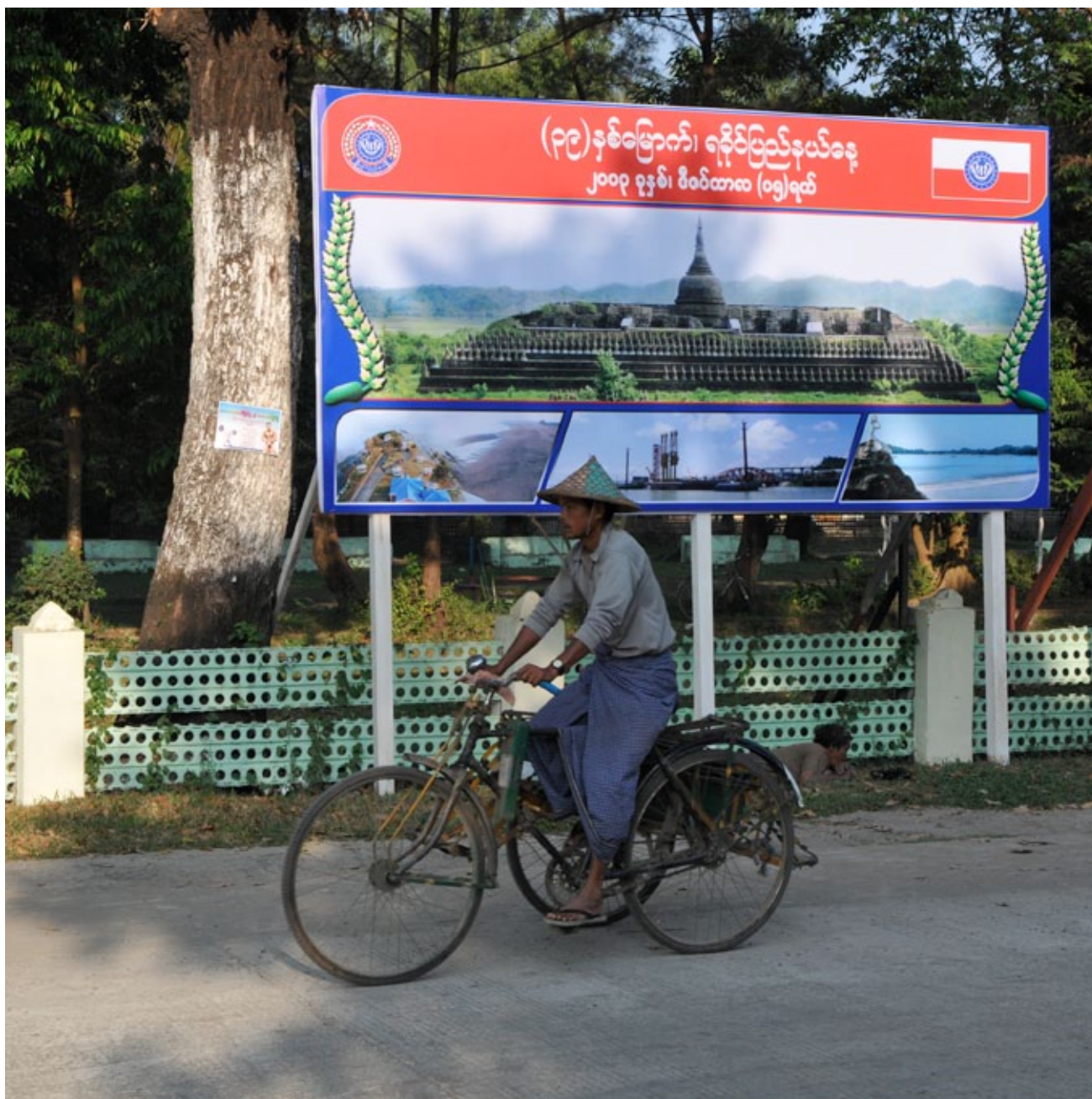
Cyclist passing “Rakhine State Day” billboard (TK)

process. In contrast, the ANC has kept to its UNFC position of not signing the NCA until there are amendments and nationwide inclusion (see box: “The ‘Eight Principles’ of the UNFC”). 59