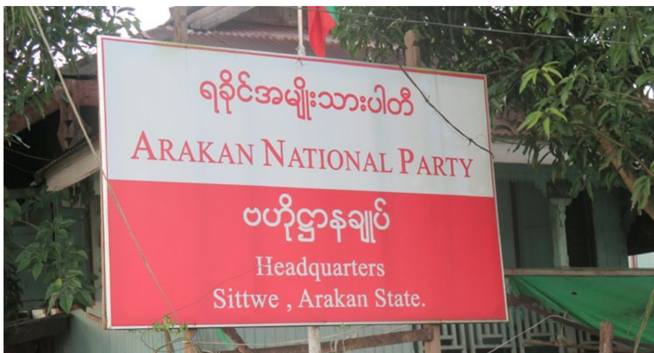
ANP headquarters in Sittwe, Rakhine State capital (IR)

As the clampdown intensified, the only Muslim candidates in Rakhine State who appeared to be accepted on citizenship grounds were from the