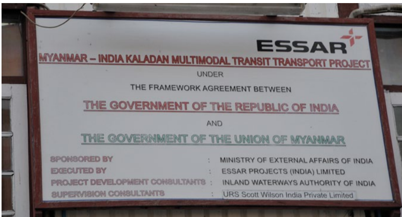
Signboard of the Kaladan Multi-Modal Transit Project (TK)

The ANP victory, though, could not be considered a political breakthrough. First, the mass exclusion of the Muslim population was a divisive blow, heralding the much greater volatility about to come. Second, the situation was also unstable in Rakhine politics. Factional differences continued, and Aye Maung’s attempt to switch to the State Assembly backfired when he failed to win the seat for Manaung-2. And third, conflict was escalating with the Arakan Army, which was stepping up military infiltration through the tri-border region. In an eight-day period at the turn of 2015–16, the state media reported 15 clashes with the Tatmadaw in Kyauktaw Township. 106