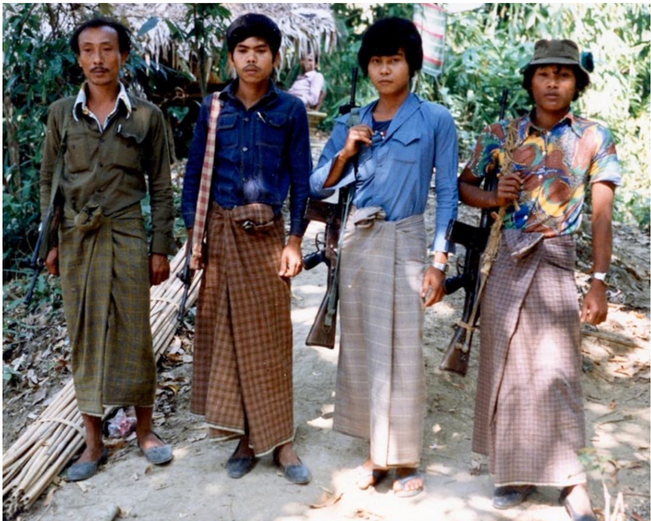
CPB White Flag troops 1987 (MS)

Into the 1980s desultory fighting continued in northern Rakhine State. Most of the refugees who had fled into Bangladesh during the 1978 clampdown were eventually allowed to return under UN auspices. But any hopes of a just resolution to their cause were quickly ended in 1982 when a new series of pressures were ratcheted up on the Muslim population under the BSPP's new Citizenship Law (see box: "Rakhine, Rohingya and the 'Politics of Labelling'"). In the future, full citizenship would only be granted to nationalities deemed "indigenous". In contrast, "non-indigenous" peoples – notably those of presumed Indian or Chinese heritage – would be allowed only "associate" or "naturalized" status unless they could prove family lineage in the country before the British annexation of Arakan in 1824. Of the Rohingya, there was no mention at all.