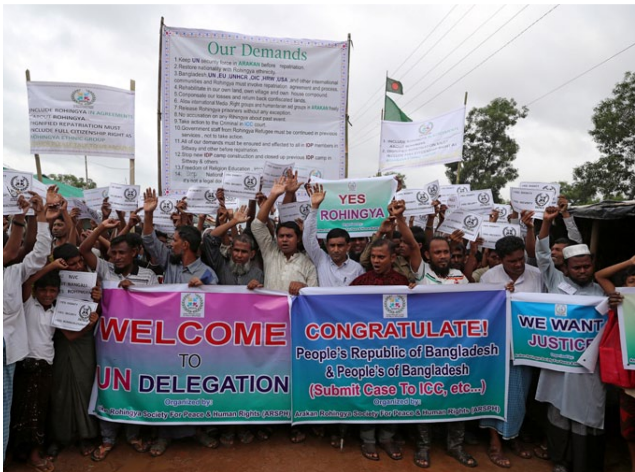
Rohingya refugees welcome UNSG António Guterres to Kutupalong camp in Bangladesh

Any hopes, however, of a political breakthrough were quickly dashed. On the day after the Advisory Commission report was published, another series of ARSA attacks was launched on 24 security outposts in Maungdaw, Buthidaung and Rathedaung townships. 84 Accusing “Bengalis” of attempting to set up an “Islamic State”, 85 the Tatmadaw responded with extraordinary force in the most intense “clearance” operation against a targeted people since the country’s independence