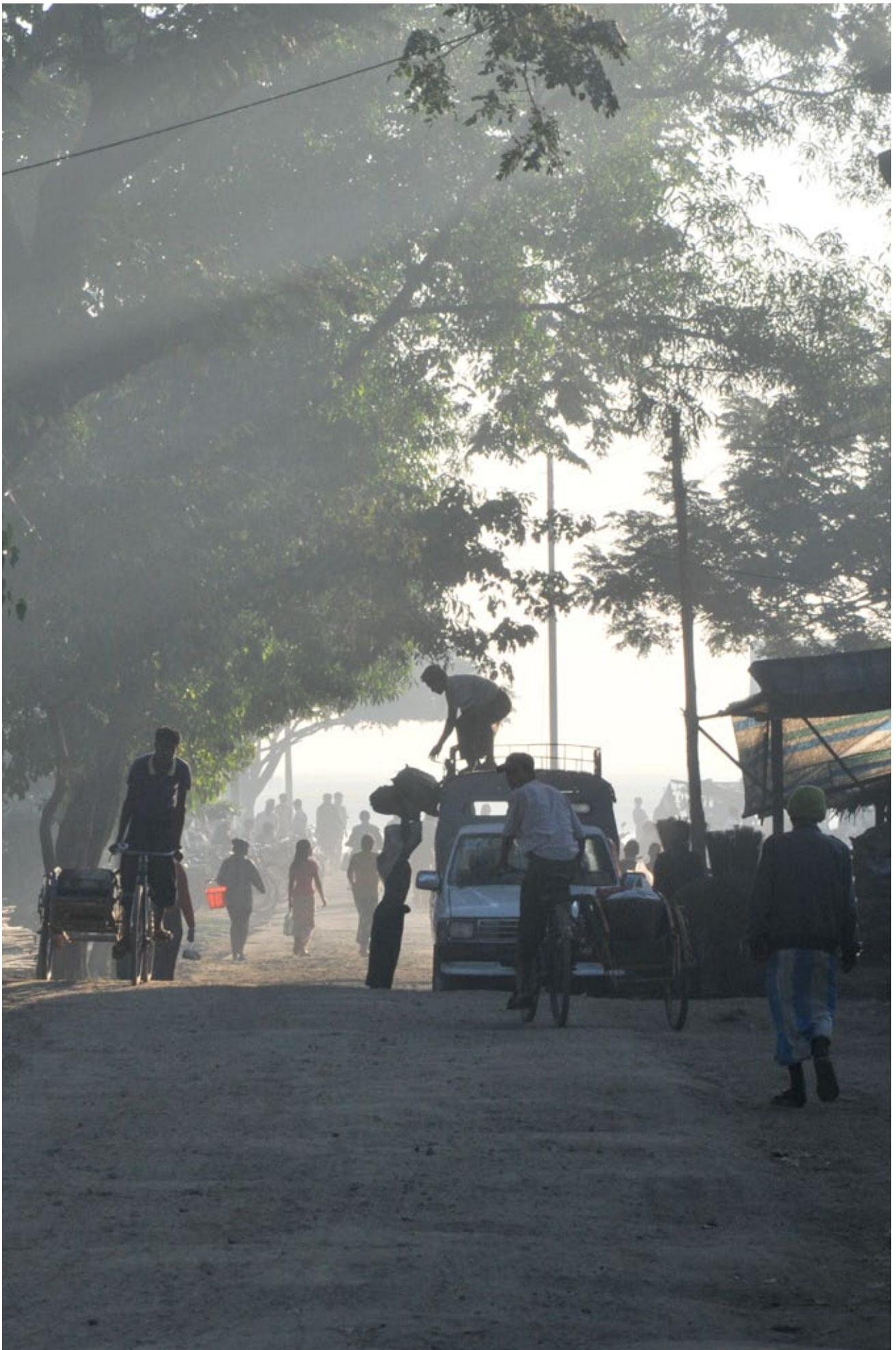
Early morning in Buthidaung (TK)