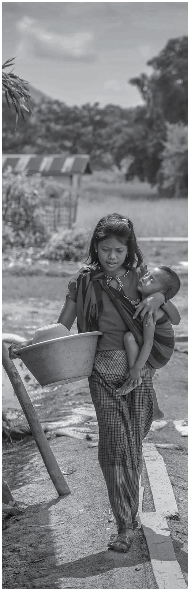
Mro girl in displacement camp carrying sibling (IR)

In the following years, this lack of expertise and planning came back to haunt the NLD. Upon taking office, the party made some fundamental errors. To continue the peace process, the government’s Union Peace Dialogue Joint Committee (UPDJC) was reformed with Aung San Suu Kyi as leader. Meanwhile a new National Reconciliation and Peace Centre (NRPC) replaced the Myanmar Peace Center (MPC) that had been responsible for ceasefire liaison under the Thein Sein administration. As a government-affiliated body, the MPC had its critics. But such abrupt changes in the peace structures adversely affected relationships among the key conflict actors. Until the present day, these failings have never been addressed.