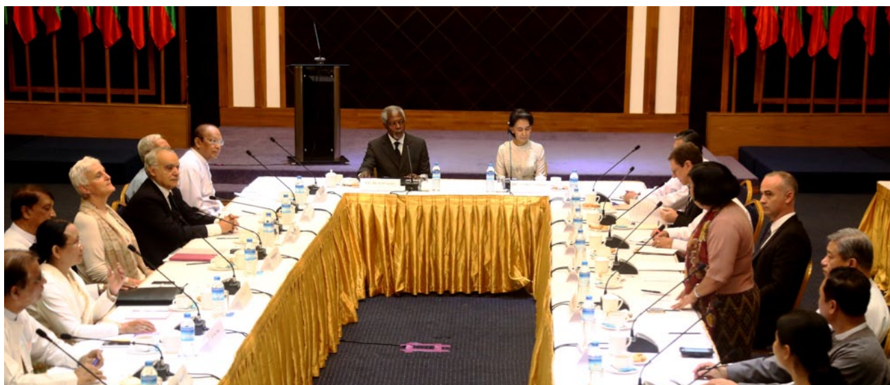
Kofi Annan and Aung San Suu Kyi at Advisory Commission meeting

To reinforce restrictions on the Muslim population, four key measures were employed by the authorities: the denial of Rohingya identity; the withdrawal of Temporary Registration Certificates which effectively removed the right to vote for holders; “Race and Religion” protection laws; and the intensification of security measures in the Bangladesh borderlands (see box: “Discriminatory