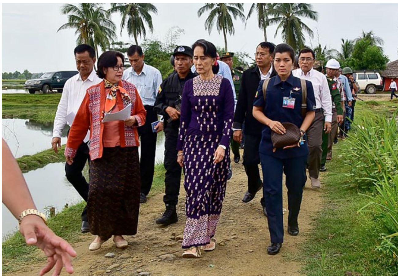
Aung San Suu Kyi visits Rakhine State

Meanwhile the ANC and its UNFC allies were not the only parties frustrated by the direction of the peace process. During early 2017, the ULA joined its Northern Alliance colleagues in northeast Myanmar in establishing a new united front among ceasefire and non-ceasefire groups on the Chinese border: the Federal Political Negotiation and Consultative Committee (FPNCC). 58 Following its April 2017 announcement, the FPNCC grew to seven organisations: the ceasefire United Wa State Army, (Mongla) New Democratic Alliance Army and Shan State Army/Shan State Progress Party (SSA/