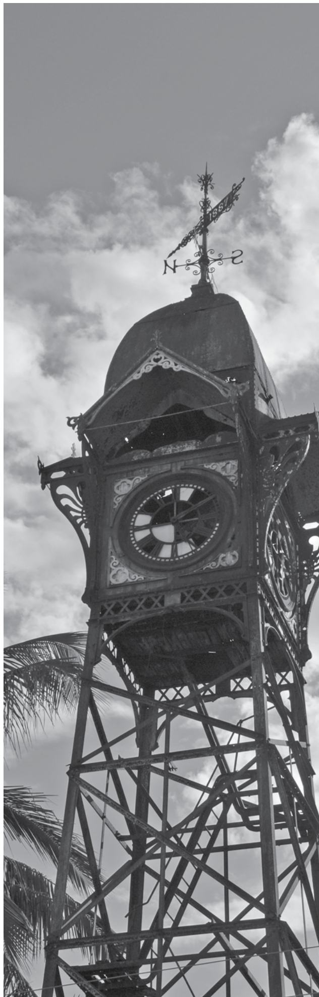
The old clock tower, Sittwe

In future years, this cross-party collaboration left an important legacy in Arakan politics. It supported a particular radicalisation of the nationalist movement involving both Marxist and Buddhist traditions after the British departure. At the national levels, the Anti-Fascist People's Freedom League, CPB and Tatmadaw all had Bamar-majority leaderships. But at the grass-roots levels in Arakan and other minority regions, communist leaders took care to support the struggles of “nationality peoples” for “self-determination” against “feudal autocracy”. 3 As wars of national liberation swept