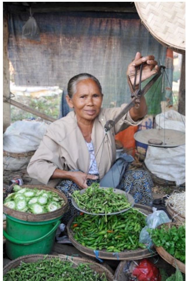
Vegetable seller at morning market in northern Rakhine State (TK)

To back these reforms up, security pressures were intensified in different parts of the country. Student protests were suppressed during the U Thant funeral in Yangon; regional clearance operations were intensified in the Bago Yoma highlands; and a major objective was achieved during 1974–75 when the Tatmadaw succeeded in driving remaining CPB and Karen forces from central Myanmar. Supply lines were effectively cut between armed opposition forces in the east and the west of the country. The government’s tactics had been heavy-handed, but the 1973 referendum and 1974 constitution were successfully pushed through.