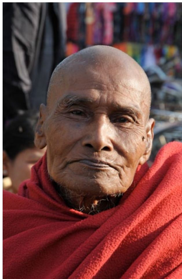
Buddhist monk in Sittwe (TK)

On this basis, foreign diplomats have lately been promoting a three step-plan for the "safe, dignified and voluntary" of refugees: the implementation of