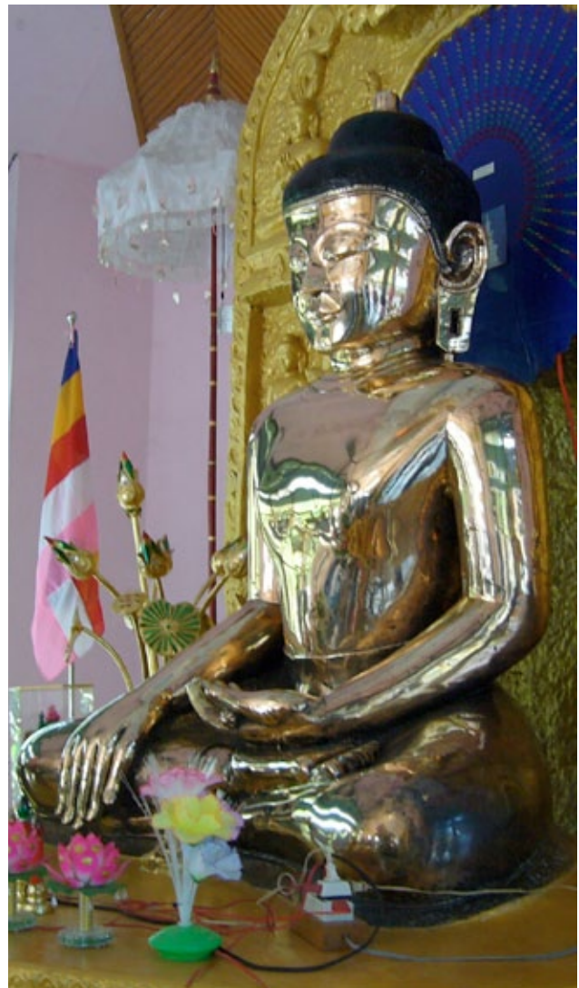
Bronze Buddha image, Mrauk-U

The focus of British administration was centred on Sittwe (Akyab), with four main districts in the division: Akyab, Arakan Hill Tracts, Kyaukpyu and Thandwe (Sandoway). Communications remained difficult. But supported by improved infrastructure and navigation, trade and agriculture expanded, and the once sleepy fishing-village of Sittwe