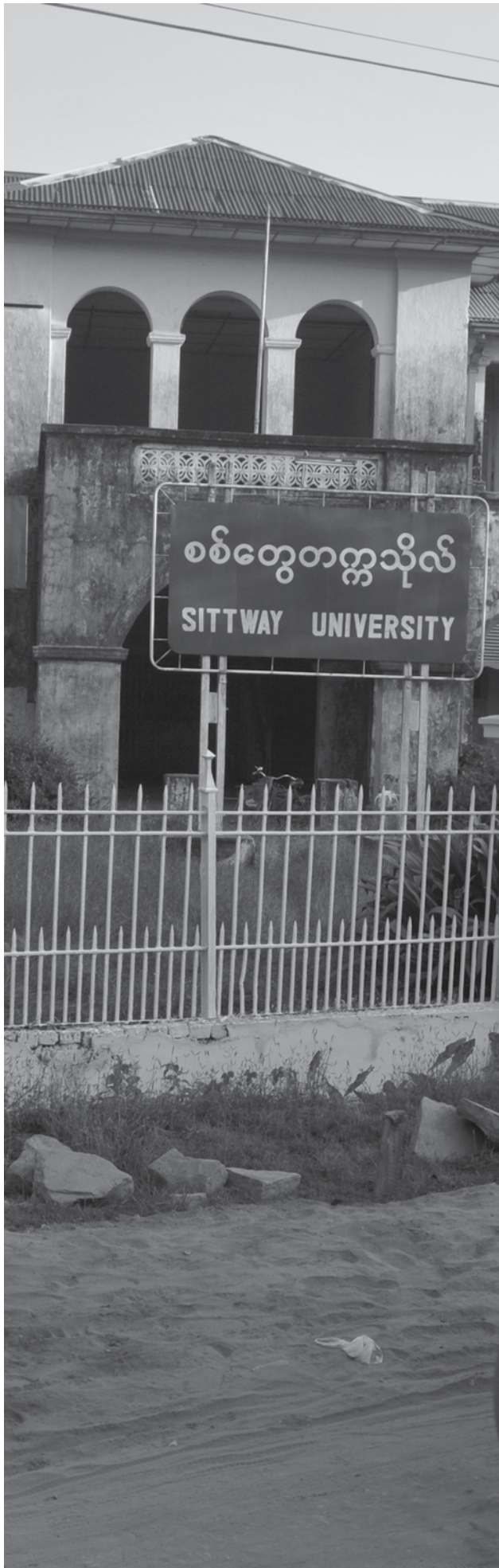
Sittwe University entrance (TK)

Following the peace talk collapse, Gen. Ne Win set out a two-track strategy to impose the “Burmese Way to Socialism” on the country: political and military. The BSPP and Tatmadaw systems ran in parallel. From the outset, the style of the BSPP government was xenophobic and austere. The constitution was suspended, key sectors of the economy nationalised, independent media closed down, and teaching in ethnic minority languages halted from fourth grade in schools. An estimated 300,000 inhabitants of perceived “Indian” ancestry