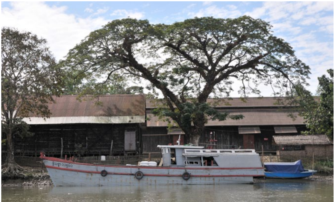
Naval supply boat in Buthidaung (TK)

the same time, a new line-up of organisations was supporting anti-government resistance in the hills: the AASYC, ALD (E), ALP, DPA and NUPA. On the surface, such fragmentation was a reflection of the government's upper hand. But Tatmadaw officers have always privately said that such a diversity of opposition movements are very difficult for the security forces to track down and control.