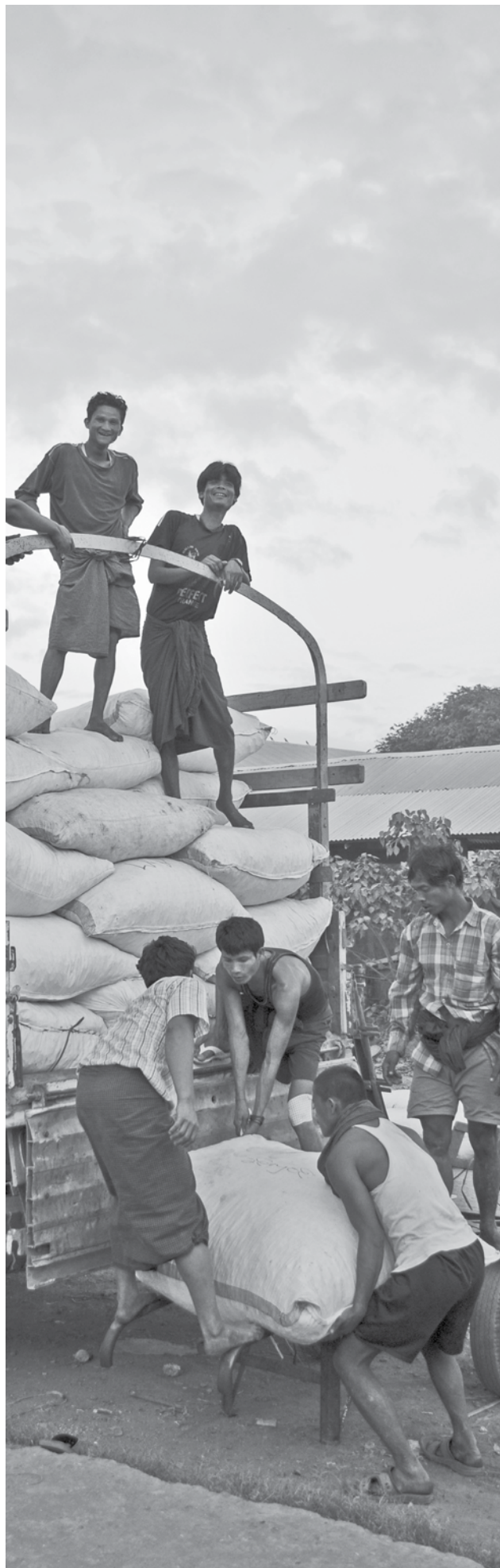
Loading food supplies in Sittwe (TK)

Many of these uncertainties are deeply felt in Rakhine State and the tri-border region with Bangladesh and India. Once again, contestations in national politics are being played out on the Arakan stage. The Bangladesh borderlands are presently the scene of one of the greatest refugee crises in the modern world. At the same time,