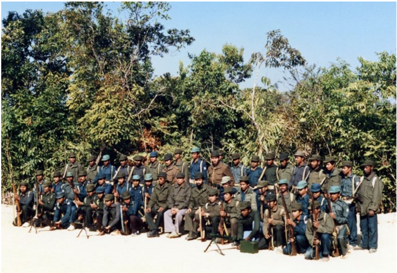
RPF troops in border camp, mid-1980s

Today these divisions and rivalries in the Bangladesh borderlands might seem obscure. But it was against this backdrop that the controversial issues of identity and ideology began to take on a deeper resonance. In the light of later events, modern-day advocates should not try and make an equivalence – or false equivalence – about actions taken by the different sides. Care is always needed in linking particular events to longer-term consequences. Human rights are universal and must be guaranteed for all people. That has always remained the fundamental need in Arakan. But during the 1980s the narratives of “Rakhine” and “Rohingya” identities began to develop in divergent ways that have had a lasting, and historically regressive, impact on ethno-political discourse in Arakan politics (see box: “Rakhine, Rohingya and the ‘Politics of Labelling’”).