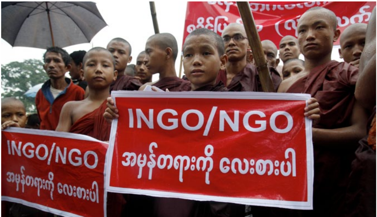
Buddhist novices protest against international organisations

the local people – and, indeed, who will really benefit? The RNDP leader Aye Maung had no doubts about the solution. “Rakhine”, he said, should be governed by “Rakhine people”. 43