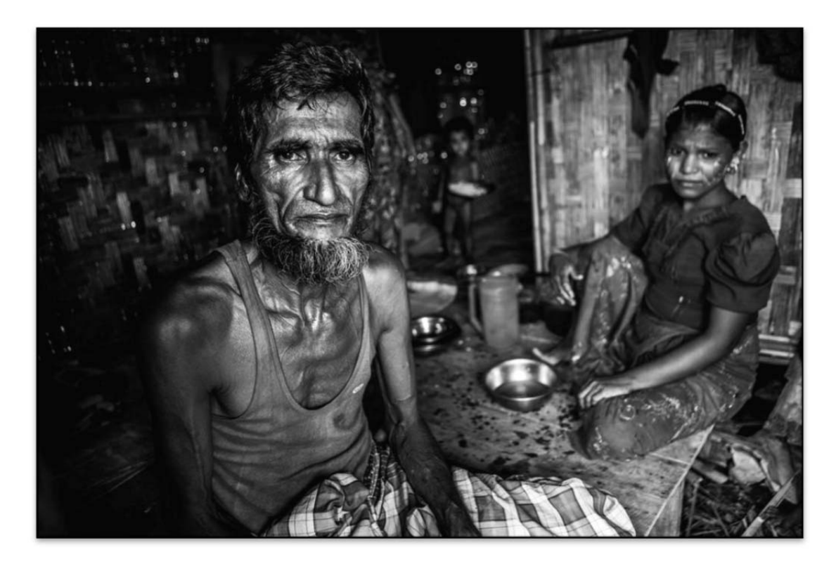
Figure 4: Rohingya Refugees in an Internally Displaced Persons Camp in Sittwe, Myanmar