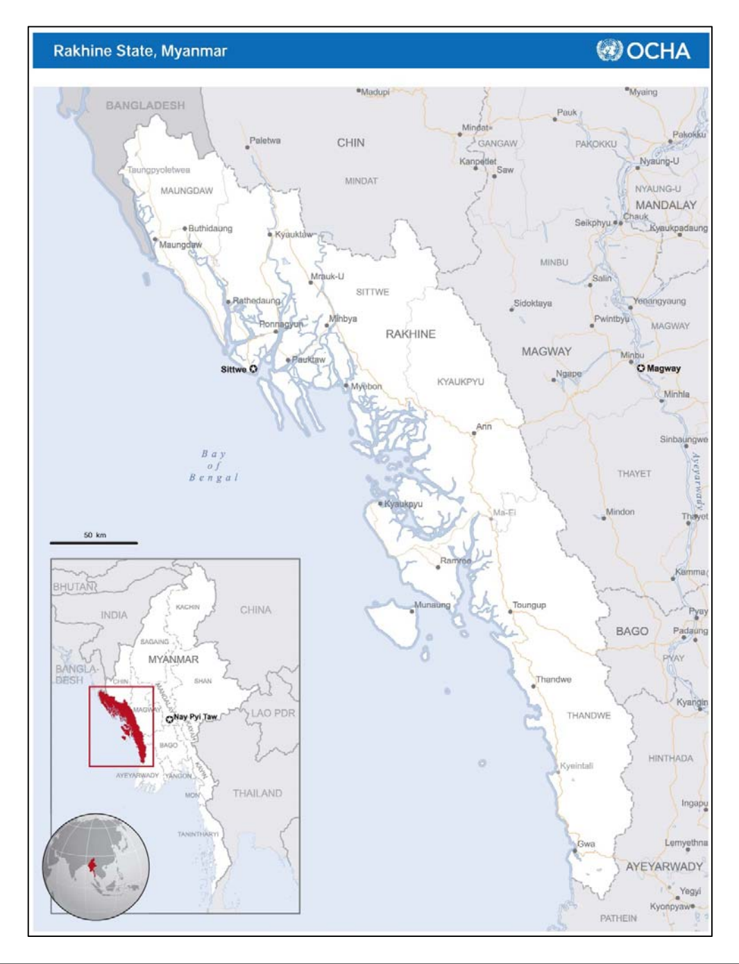
Figure 2: Map of Rakhine State