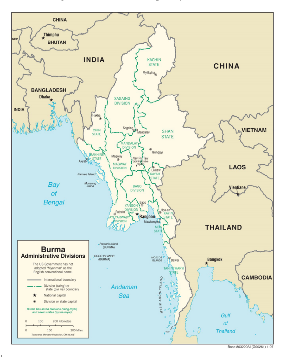
Figure 1: Administrative Map of Myanmar/Burma