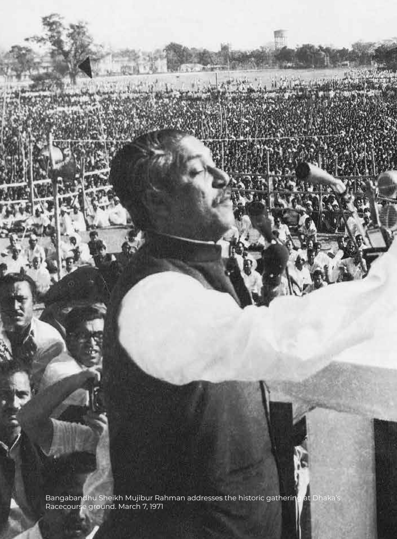
Bangabandhu Sheikh Mujibur Rahman addresses the historic gathering at Dhaka's Racecourse ground. March 7, 1971