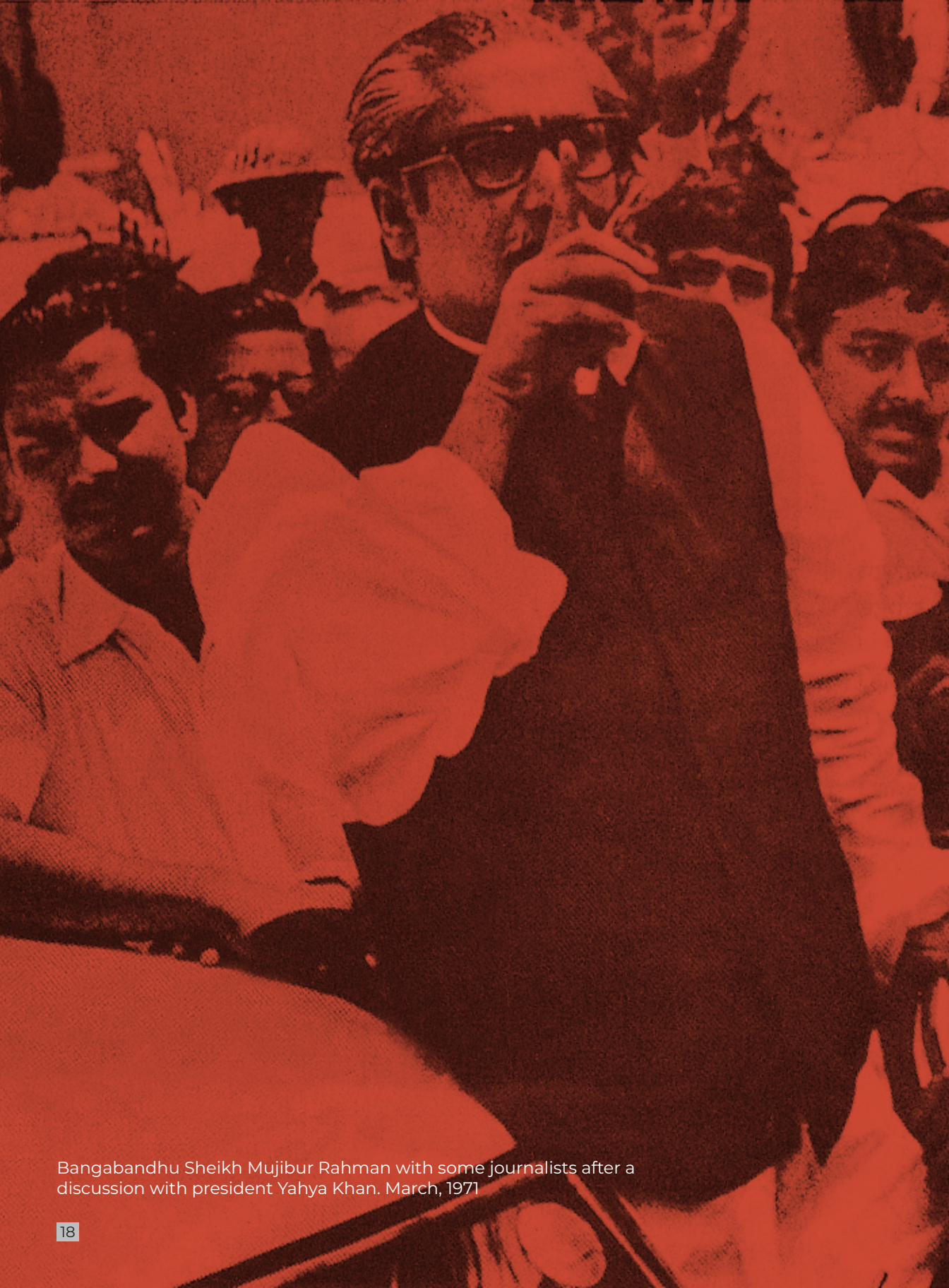
Bangabandhu Sheikh Mujibur Rahman with some journalists after a discussion with president Yahya Khan. March, 1971