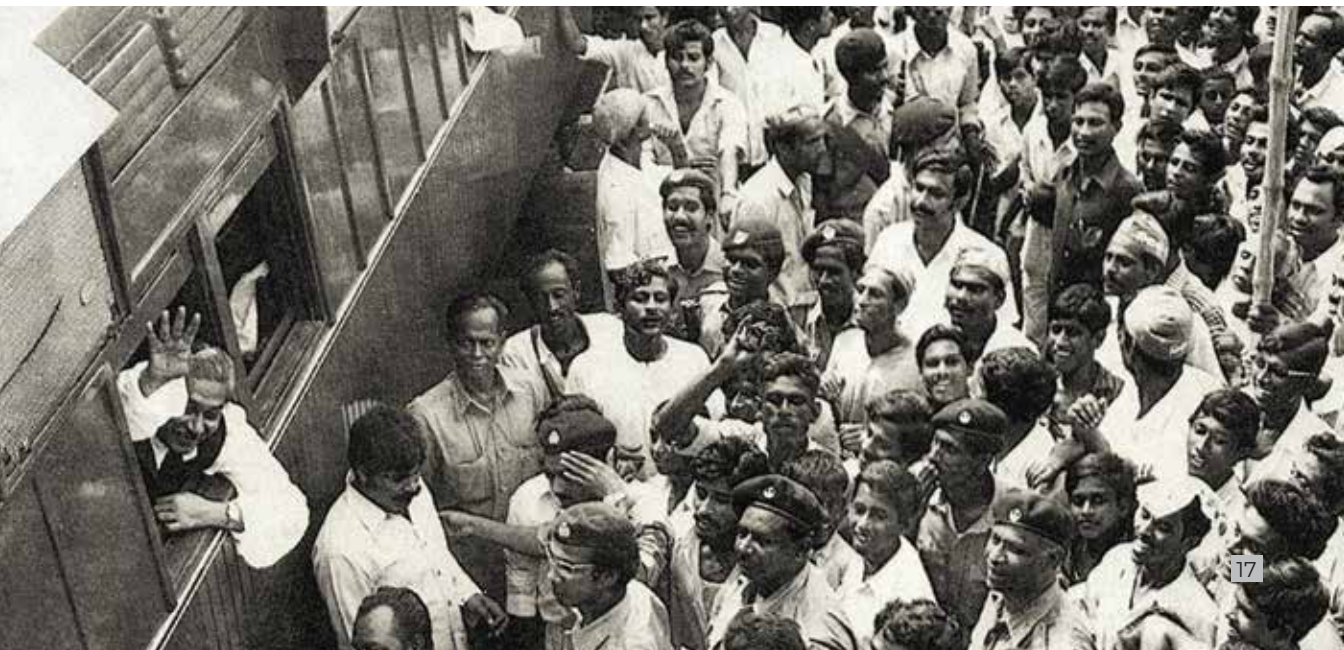
Bangabandhu Sheikh Mujibur Rahman in a train rally during a election campaign. 1970

During the eventful decade of 1960s, Mujib was pivotal in uniting the Bangalis against the ruling class concentrated in West Pakistan. It was Mujib who, in December 1969, proclaimed that henceforth his land (East Pakistan) would be known as "Bangladesh." The mass upsurge of 1969, spearheaded by Mujib, set in motion the preparation for an armed struggle for independence. He became the undisputed leader.