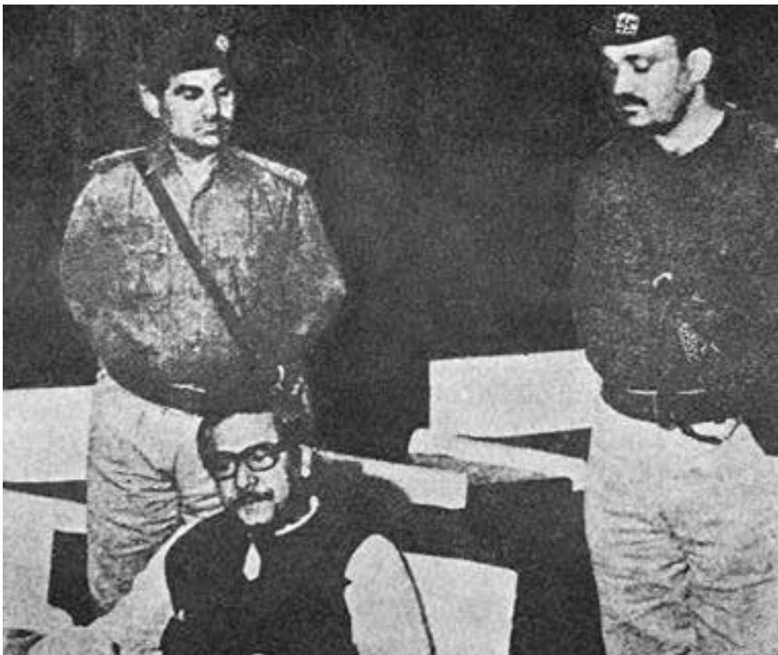
Bangabandhu Sheikh Mujibur Rahman was arrested from his Dhanmondi residence at 1:30 am of, on March 26, 1971.

Mujib was arrested from his residence in that night and was taken to a West Pakistan jail. Bangalis would plunge into a full-fledged war against the Pakistan Army for the next nine-months.