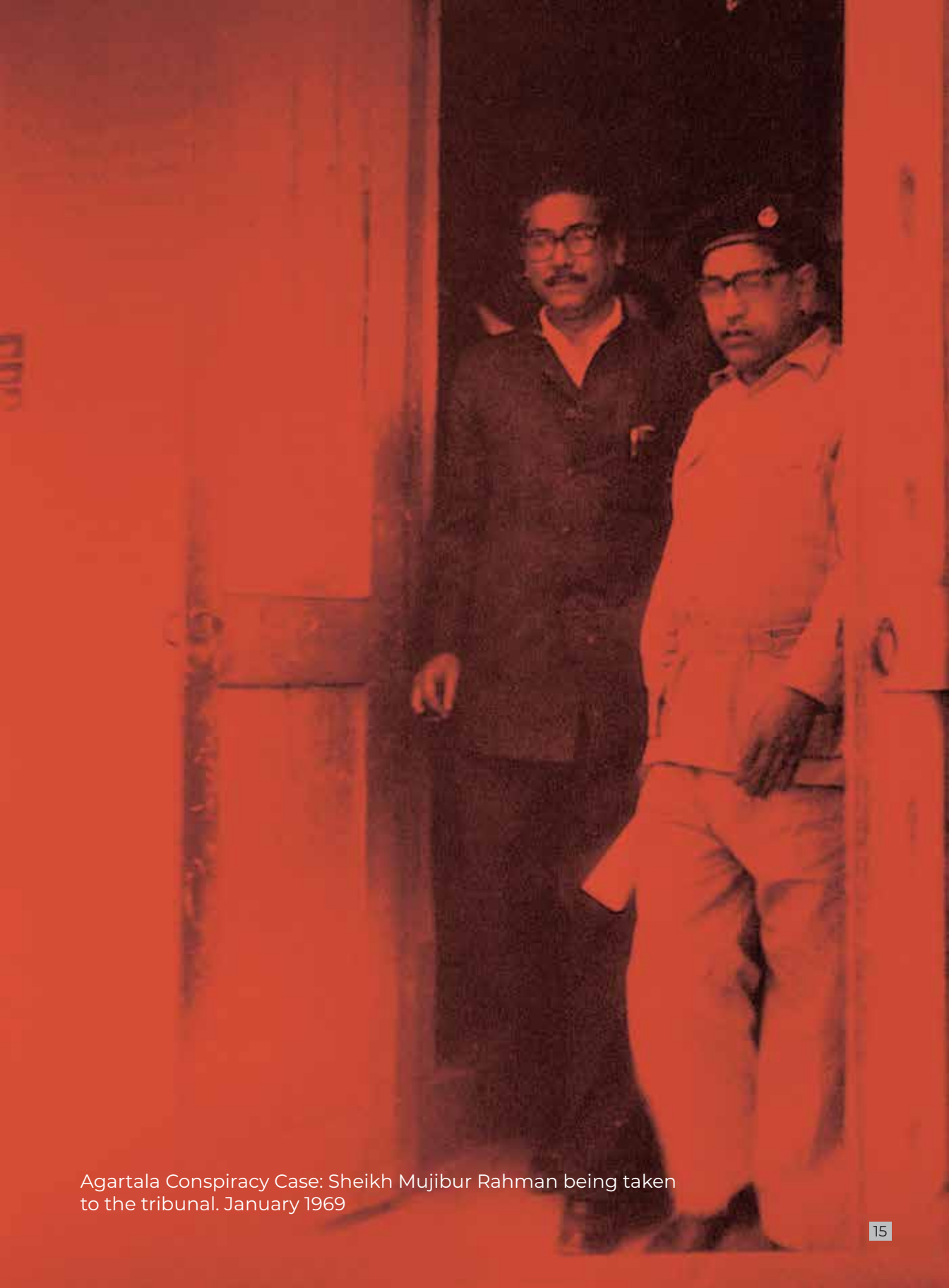
Agartala Conspiracy Case: Sheikh Mujibur Rahman being taken to the tribunal. January 1969