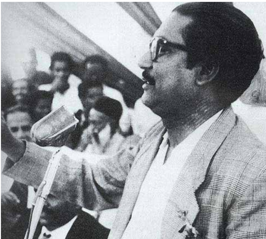
Sheikh Mujibur Rahman presenting the Six-point formula. February 5, 1966, Lahore

On February 5, 1966 in Lahore, Sheikh Mujibur Rahman, as the general secretary of the Awami League (AL), revealed a formula for regional autonomy for the federating provinces of Pakistan. The formula later was to be credited as the "charter of freedom" in the struggle for self-determination of Bangalis from the West Pakistan's domination.