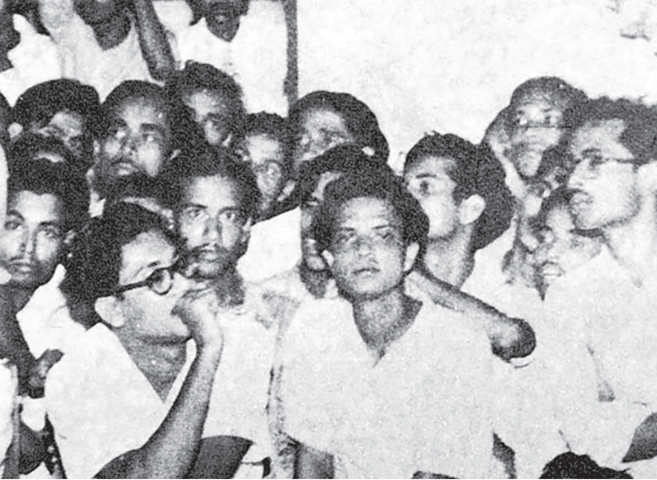
Sheikh Mujibur Rahman in a consultation with party coworkers.