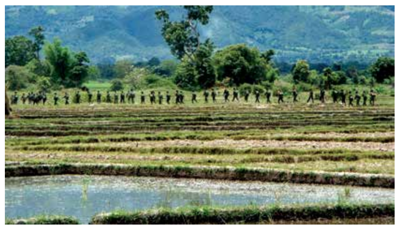
Myanmar Army patrolling in Maungdaw

temporarily in a village school), one near Fatia Pass, and one near Brizi Pass (where women caught fleeing across the Mayu mountains were detained, as detailed earlier).